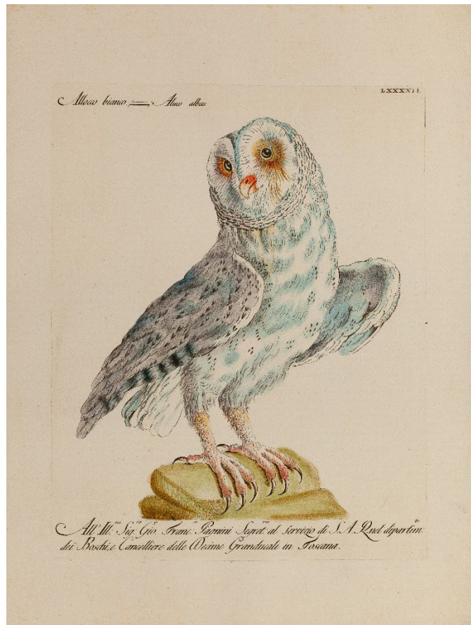
Aluco Bianco by Xaviero Manetti

Powered by Science. Inspired by Nature. Founded in 1916, the Santa Barbara Museum of Natural History inspires a thirst for discovery and a passion for the natural world. The Museum seeks to connect people to nature for the betterment of both, and prides itself on being naturally different . For more information, visit sbnature.org .