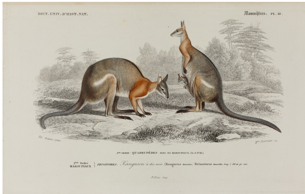
Charles d'Orbigny – Universal Dictionary of Natural History c.1840