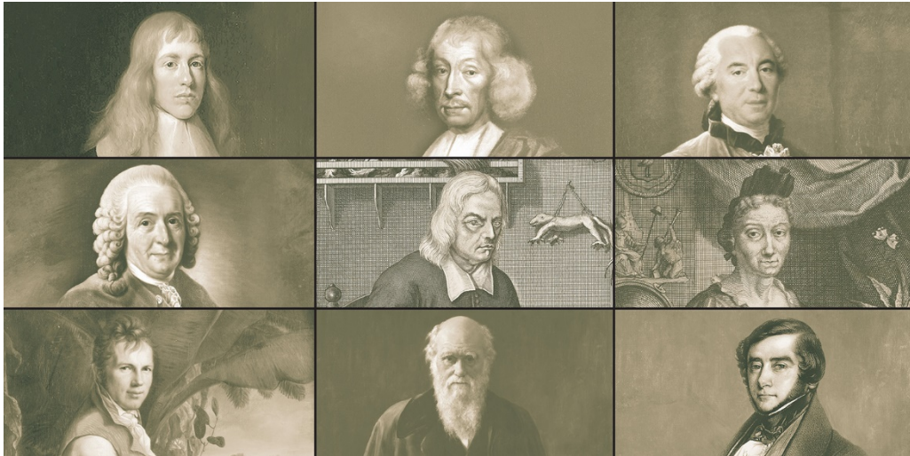
Top left to bottom right: Francis Willughby (1635-1672), John Ray (1627-1705), Comte de Buffon (1701-1788), Carl Linnaeus (1707-1778), Georg Everhard Rumpf (1628-1702), Maria Sibylla Merian (1647-1717), Alexander von Humboldt (1769-1859), Charles Darwin (1809-1882), Alcide d'Orbigny (1802-1857)