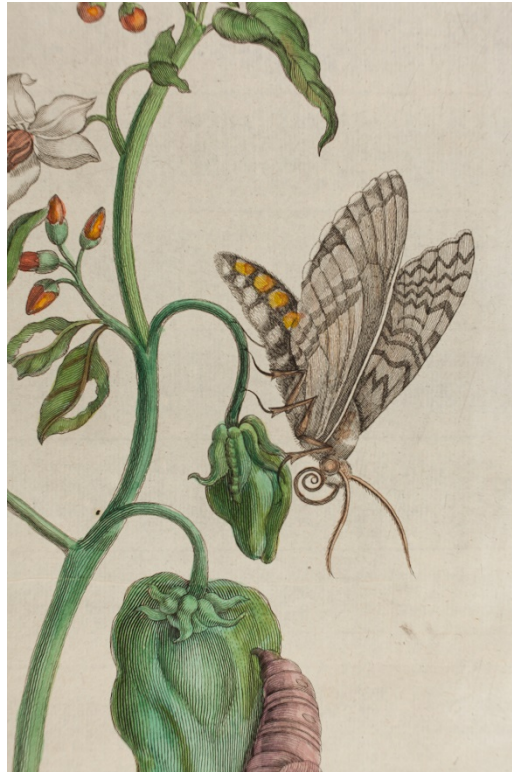
Maria Sibylla Merian – Metamorphosis of the Insects of Surinam c. 1704