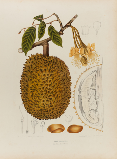
Berthe Hoola Van Nooten – Durian