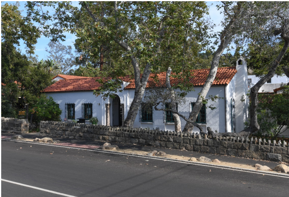
View of restored Scottish picket wall and new pedestrian esplanade along Puesta del Sol