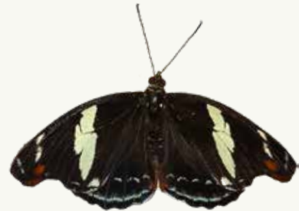
BLUE-FROSTED BANNER Cantonephele numilia (female)