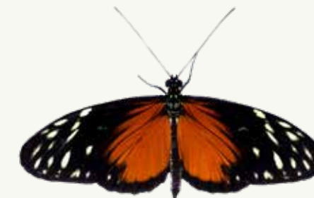
TIGER LONGWING Heliconius hecale