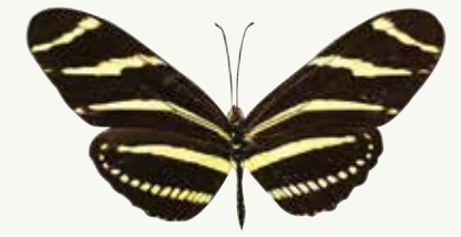
ZEBRA LONGWING Heliconius charithonia