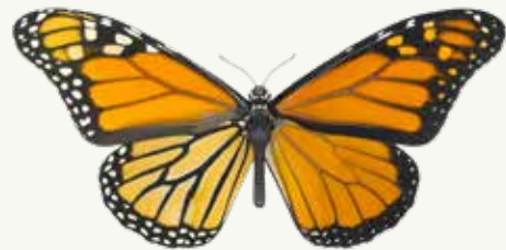
MONARCH* Danaus plexippus