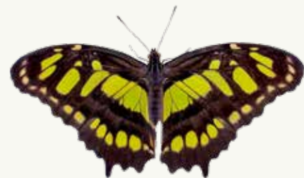
MALACHITE Siproeta stelenes