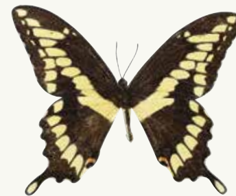
GIANT SWALLOWTAIL Papilio cresphontes