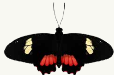
TRUE CATTLEHEART Parides eurimedes