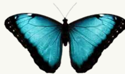
BLUE MORPHO Morpho peleides