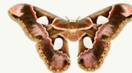
SILKMOTH Rothschildia lebeau