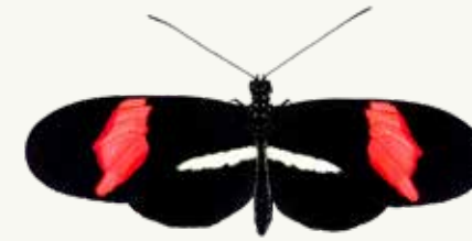
POSTMAN Heliconius melpomene