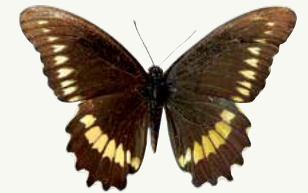
POLYDAMAS SWALLOWTAIL Battus polydamas