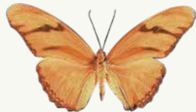
JULIA LONGWING Dryas iulia