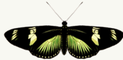
DORIS LONGWING Laparus doris