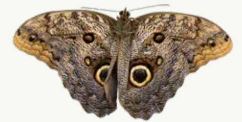
GIANT OWL Caligo sp.

FLIP OVER FOR TIPS ON SPOTTING THESE BUTTERFLIES. CHECK THE BOARD TO SEE IF THERE ARE OTHER UNIQUE SPECIES OF BUTTERFLIES VISITING THE PAVILION.