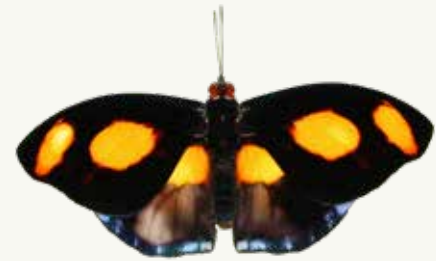
BLUE-FROSTED BANNER Cantonephele numilia (male)