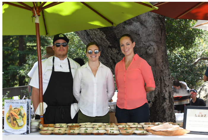
The Lark Restaurant