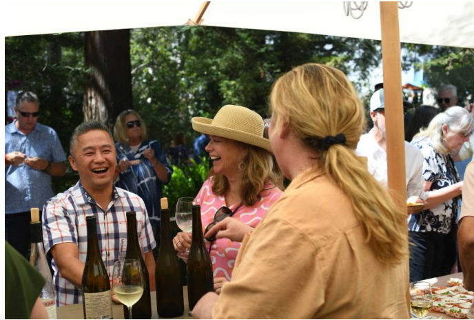
Guests enjoying wine tasting at 2018 festival