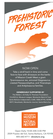
print ad recognition