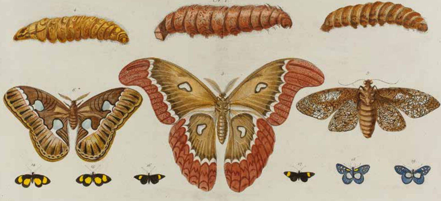
Pieter Tanjé and other artists, Butterflies, Moths, and Caterpillars from Dutch Colonies in the East Indies, the Americas, and West Africa , hand-colored engraving from Albertus Seba, Locupletissimi Rerum Naturalium Thesauri (1734-65)