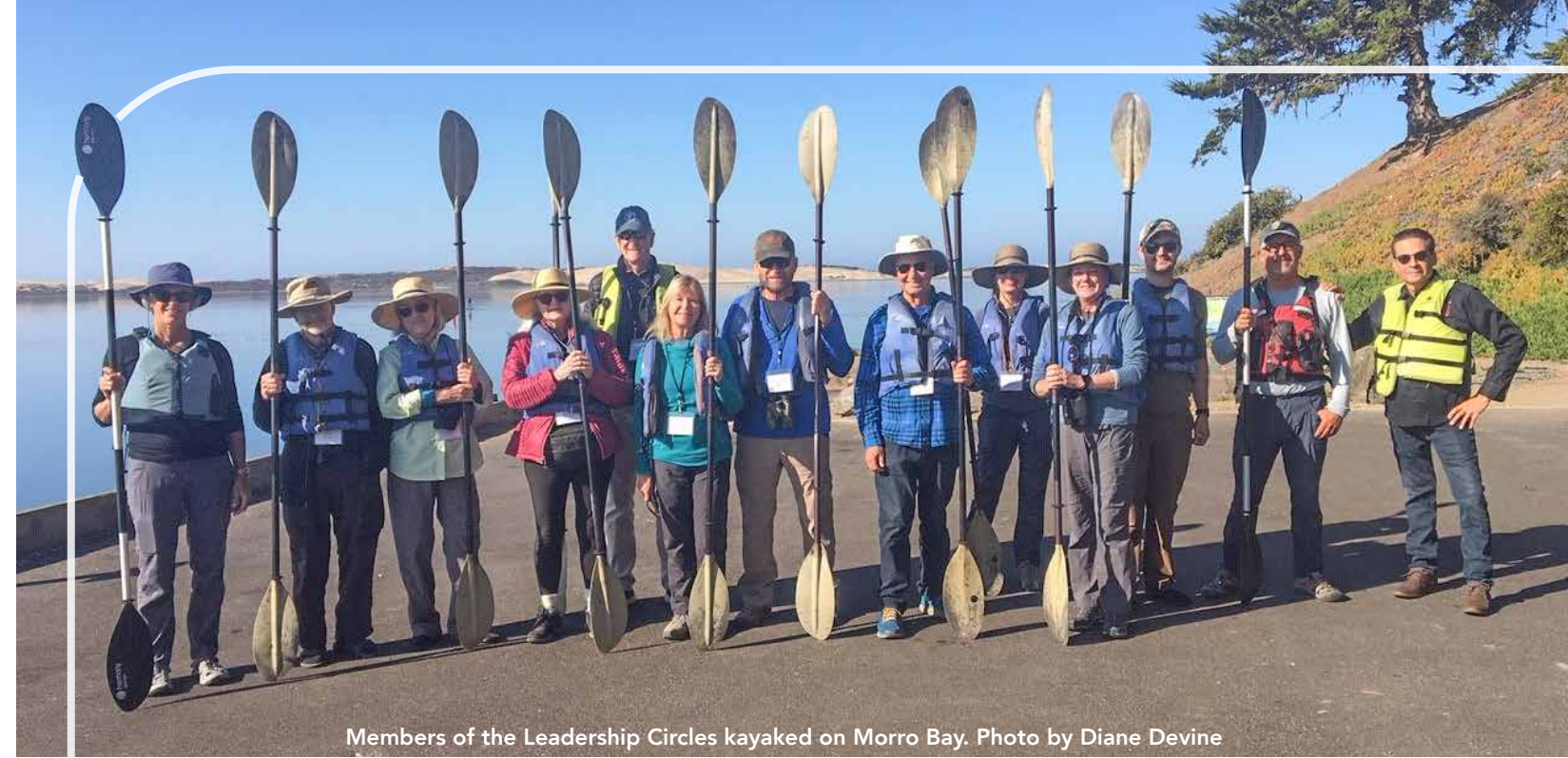
Members of the Leadership Circles kayaked on Morro Bay.