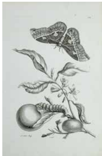
Maria Sibylla Merian, Rothschildia Silk Moth, Caterpillar, and Pupa on Seville Orange Tree , engraving from Metamorphosis Insectorum Surinamensium (1705)