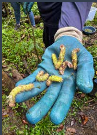
The butterflies in our pavilion start life as Costa Rican caterpillars. Morpho caterpillars in their fifth instar are collected by hand and moved to the pupation area.

O n any given day, there are about 1,000 live butterflies in the Sprague Butterfly Pavilion. You can watch them emerge from their chrysalises in Santa Barbara Gallery, but where did they begin life? The short answer is Costa Rica . . . but it's not just another global supply chain. Our connection is a way we can help build economic strength, community resilience, and ecological stability in one of the most biodiverse places on Earth.