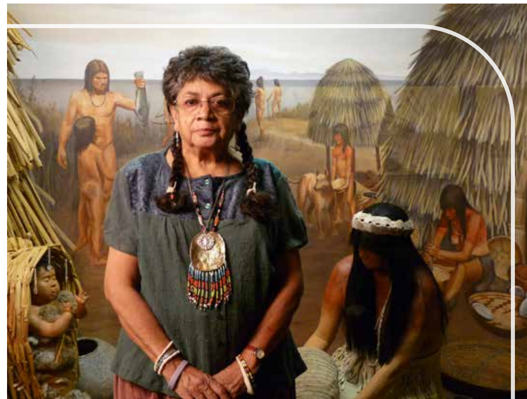
Standing proud to represent her ancestors in 6 Generations: A Chumash Family's History.