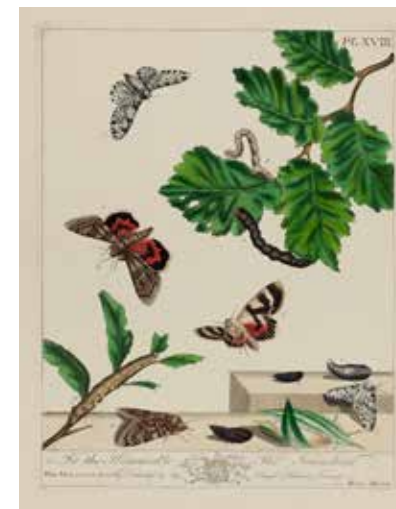
Moses Harris, Peppered moths and red underwing moths , hand-colored engraving from The Aurelian, or Natural History of English Moths and Butterflies (1766)

Among such artists was Moses Harris, secretary to London's Society of Aurelians, perhaps the world's first entomological society. His extensive Lepidoptera collection enabled him to publish The Aurelian, or Natural History of English Moths and Butterflies (1766) which included 44 engravings, all "Drawn, Engraved and Coloured from the Natural Subjects" by Harris himself. Following Merian's compositional example, his view of peppered and red underwing moths brings insects to life. The book cost the equivalent of over $1,000 in today's money, yet found plenty of buyers. Dedications to elite individuals decorate each illustration, advertising The Aurelian's genteel status.