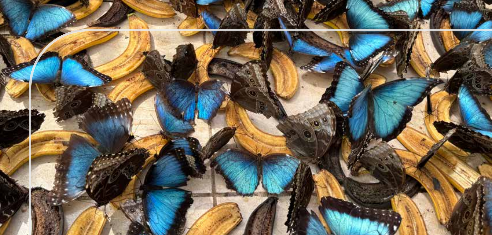
Blue Morphos feast on overripe bananas.