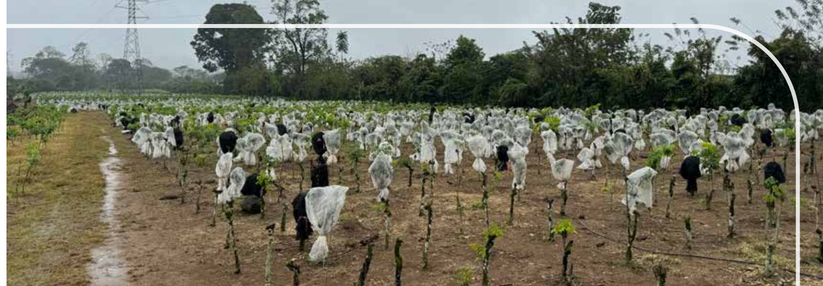
These host trees are covered with mesh sacks to prevent predation and infection of caterpillars. Each tree can have 50–100 caterpillars. Below: To prevent parasites, farmers control where Morpho butterflies lay their eggs, providing only a small collection of host plant leaves each day.

The next time you step into our pavilion, we hope you imagine Costa Rica—from the incredible biodiversity of that tiny Central American country to the family raising butterflies in their backyard. Meanwhile, you can help butterflies in your own backyard by reducing your own use of pesticides—and help butterflies worldwide by being mindful of how pesticides are employed in the agricultural products you purchase.