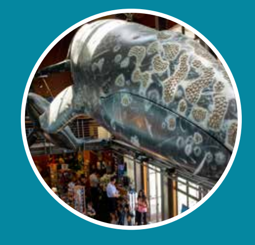
92,216 guests enjoyed the Sea Center