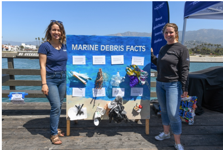
Community partners will be present during the festival