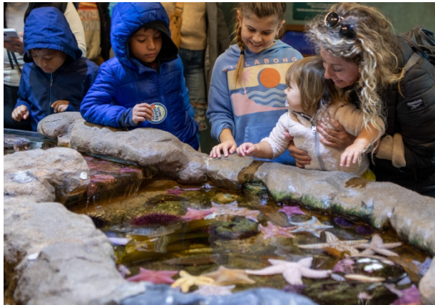
Guests enjoy meeting sea stars at the Sea Center