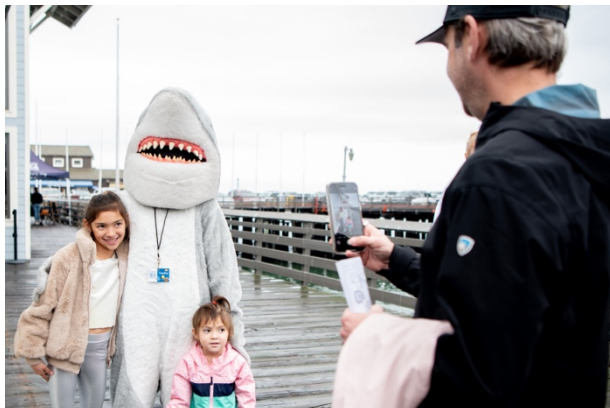
Family photos with Toothy the Shark