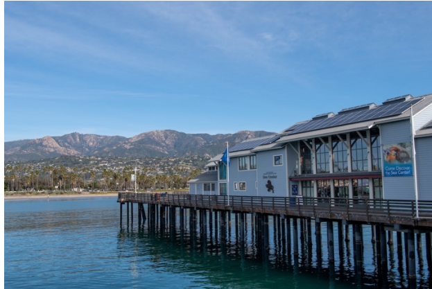
The Sea Center on Stearns Wharf

Located on historic Stearns Wharf, this highly interactive regional aquarium and marine education facility offers guests close encounters with marine animals, and exploration of the Santa Barbara Channel on the Wet Deck. In addition to permanent exhibits, the Sea Center hosts unique events and special educational programming, including Underwater Parks Day and World Oceans Day.