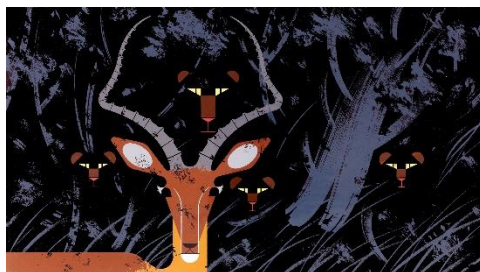
Hungry Eyes by Charley Harper