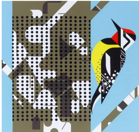
Yellow-bellied Sapsucker by Charley Harper