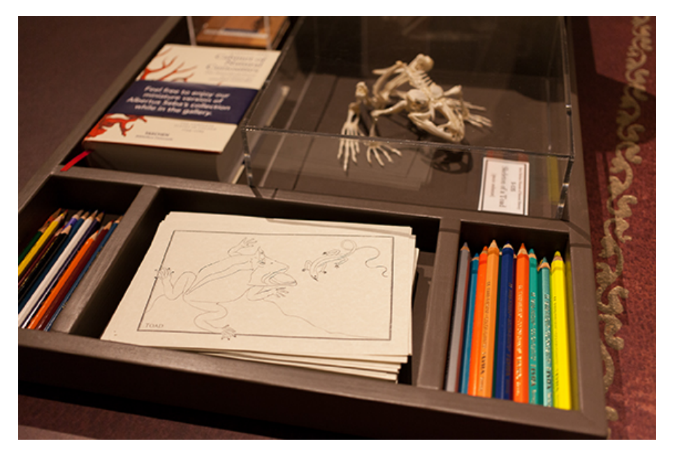
Drawing table for visitors to color illustrations