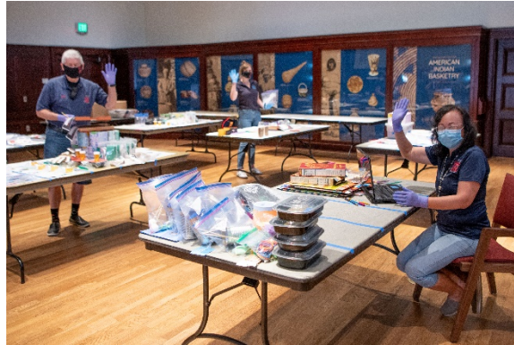
Camp counselors safely assembling Camp Kits to be sent to campers.