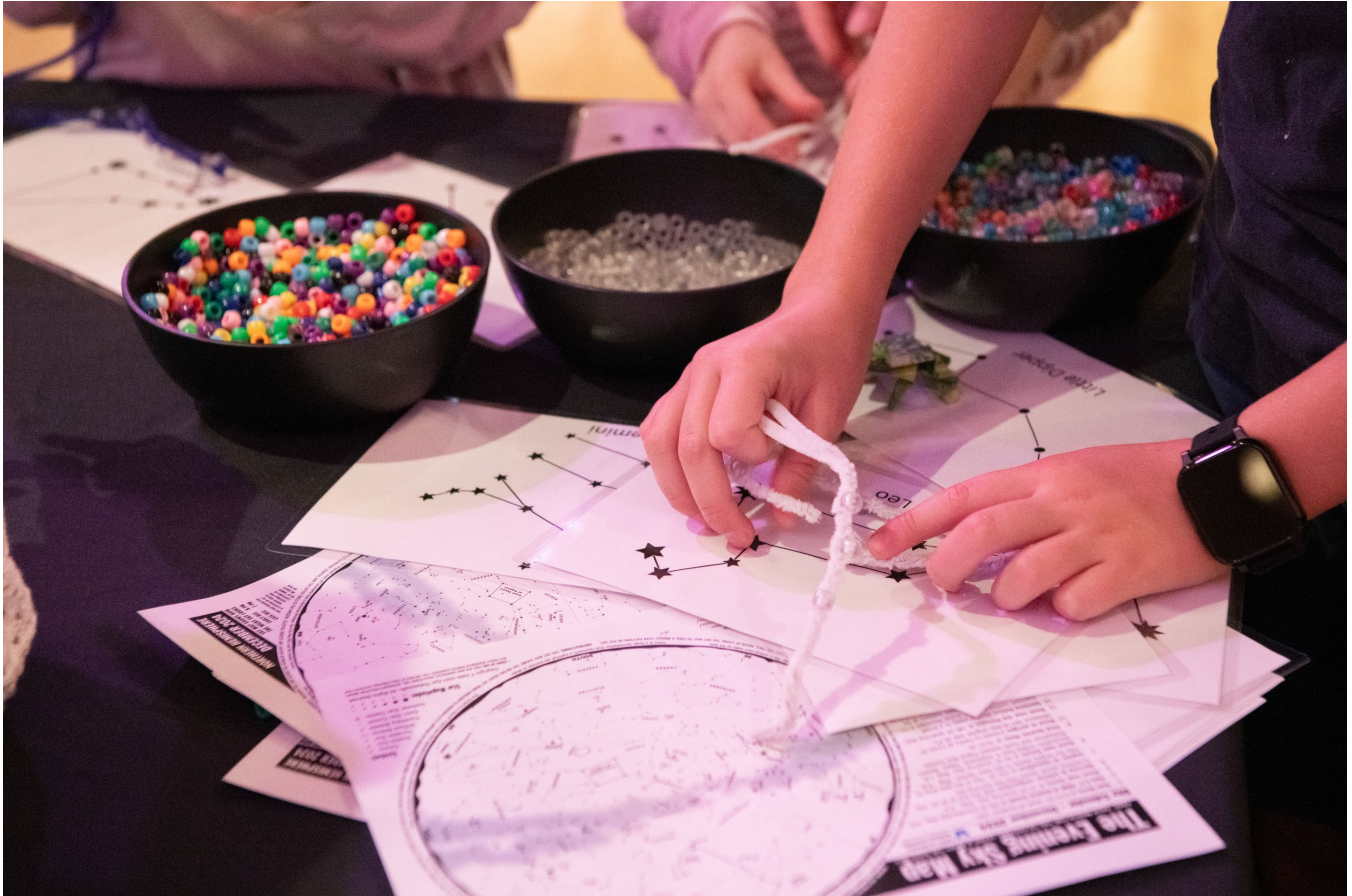
Constellation-making will be one of many activities in Fleischmann Auditorium.